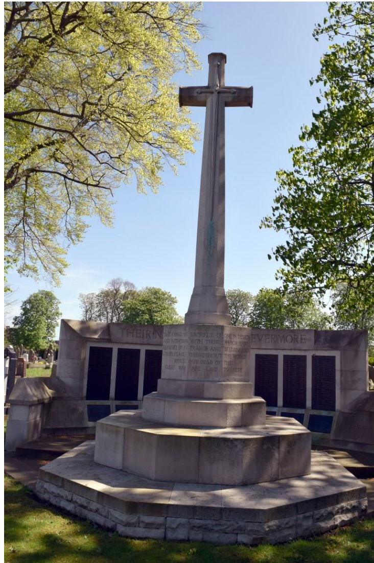
Cross of Sacrifice (above) & CWGC War Graves (below)